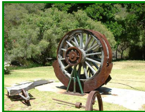
Water Wheel, Ellensbrook

Check out the National Trust's website for further information about membership, visiting properties and education resources. www.ntwa.com.au