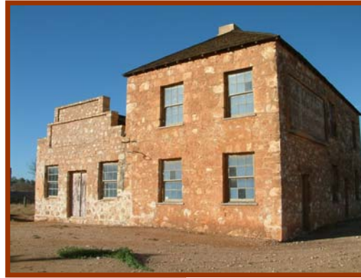
Gray's Store, Greenough