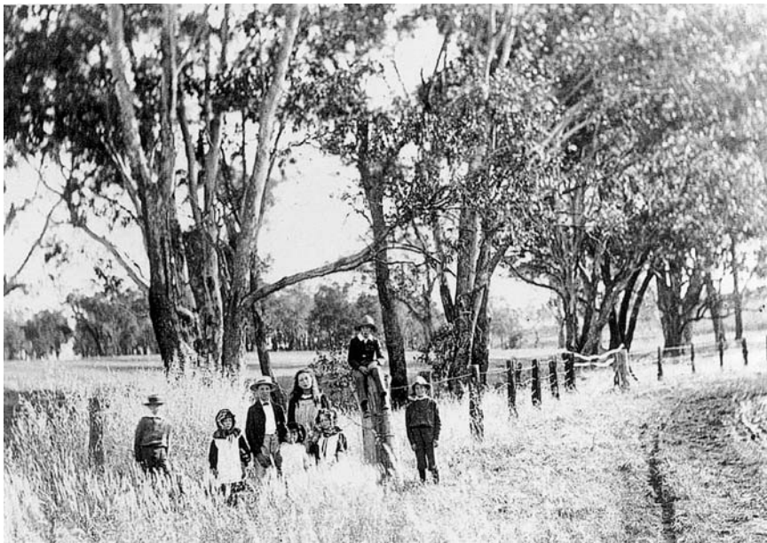
Left: The Harper children growing up at Woodbridge

Alternative programs available for younger students.